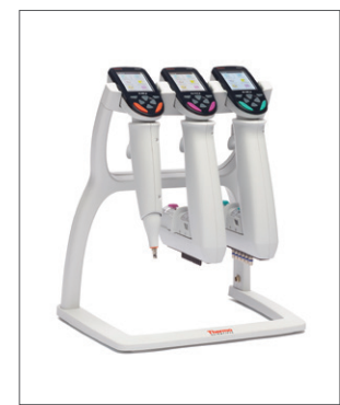
E1-ClipTip Multi Charging Stand