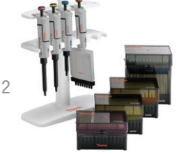
F1-ClipTip GLP Kit 2