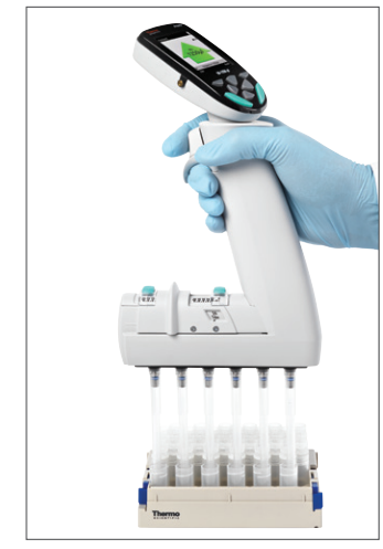
E1-ClipTip Equalizer Pipette

(See chart on the back for more details on adjustable tip spacing)