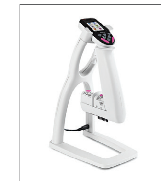
E1-ClipTip Single Charging Stand